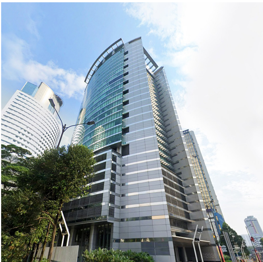
MENARA TUN ISMAIL MOHAMED ALI