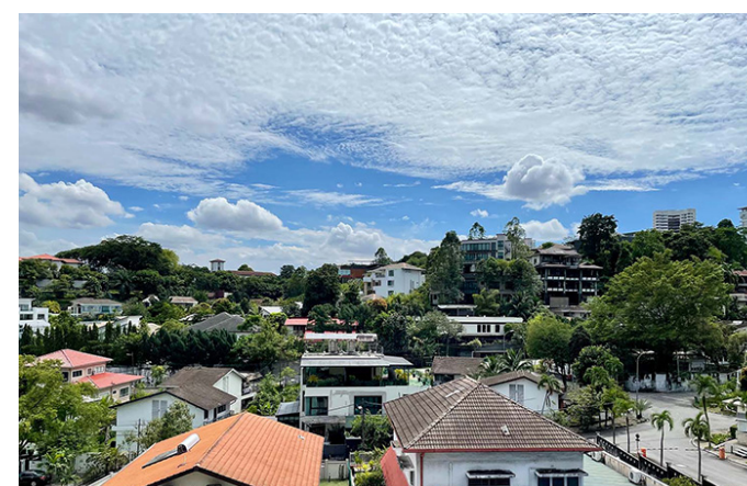
View from Master Bedroom