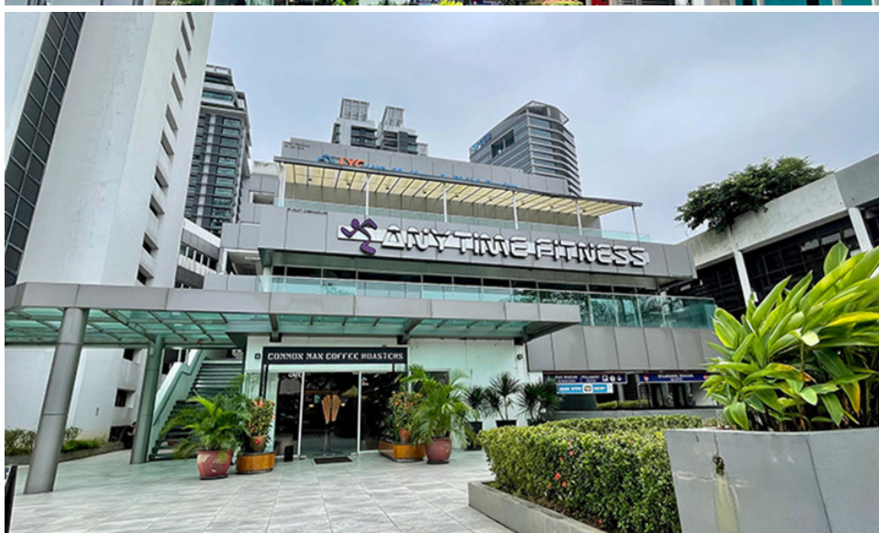
TOWER BLOCK PLAZA VADS