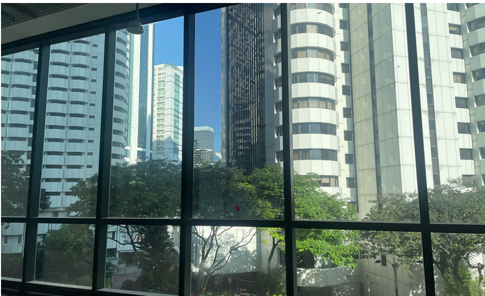
VIEW FROM UNIT 2.2