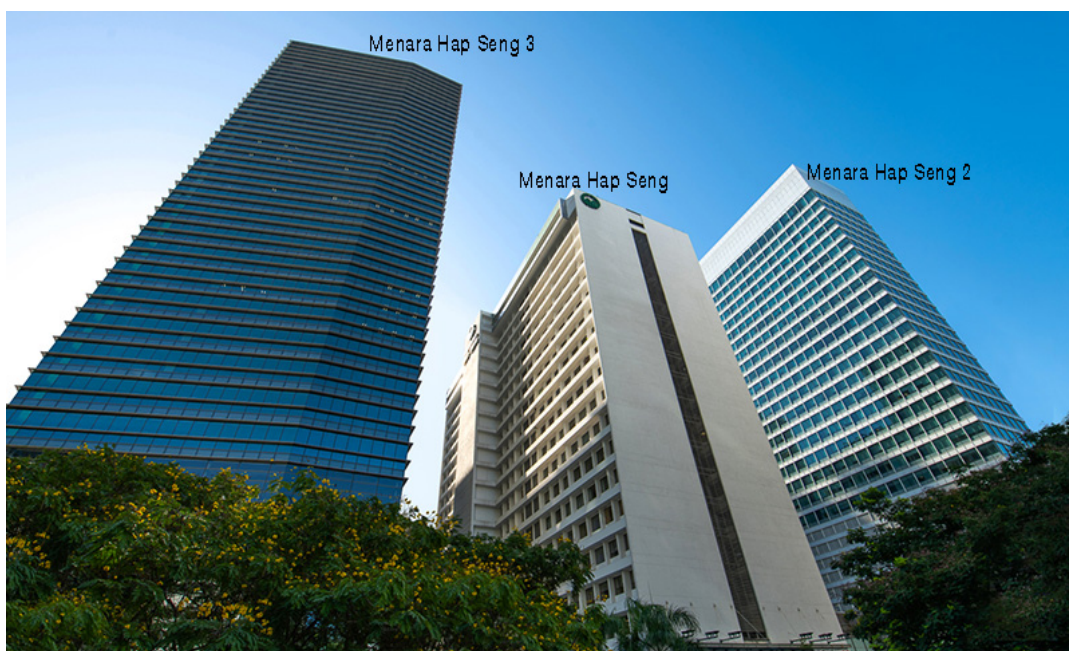
PLAZA HAP SENG