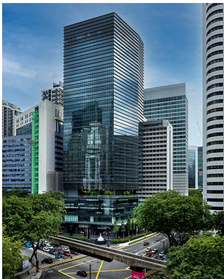
MENARA HAP SENG 3

All three Menara Hap Seng buildings (1-3) are interconnected, with occupancy rates ranging from 80% to 100% (Menara Hap Seng 2).