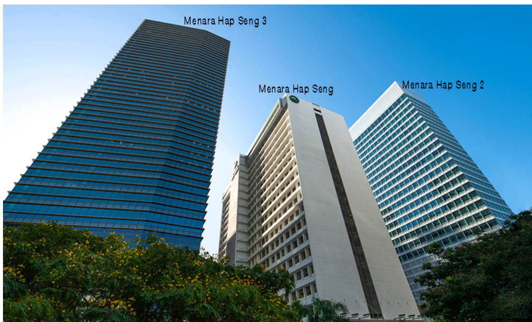
PLAZA HAP SENG

All three Menara Hap Seng buildings (1-3) are interconnected, with occupancy rates ranging from 80% to 100% (Menara Hap Seng 2).