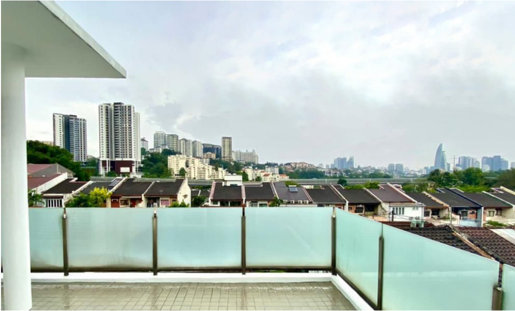
Master Bedroom Balcony