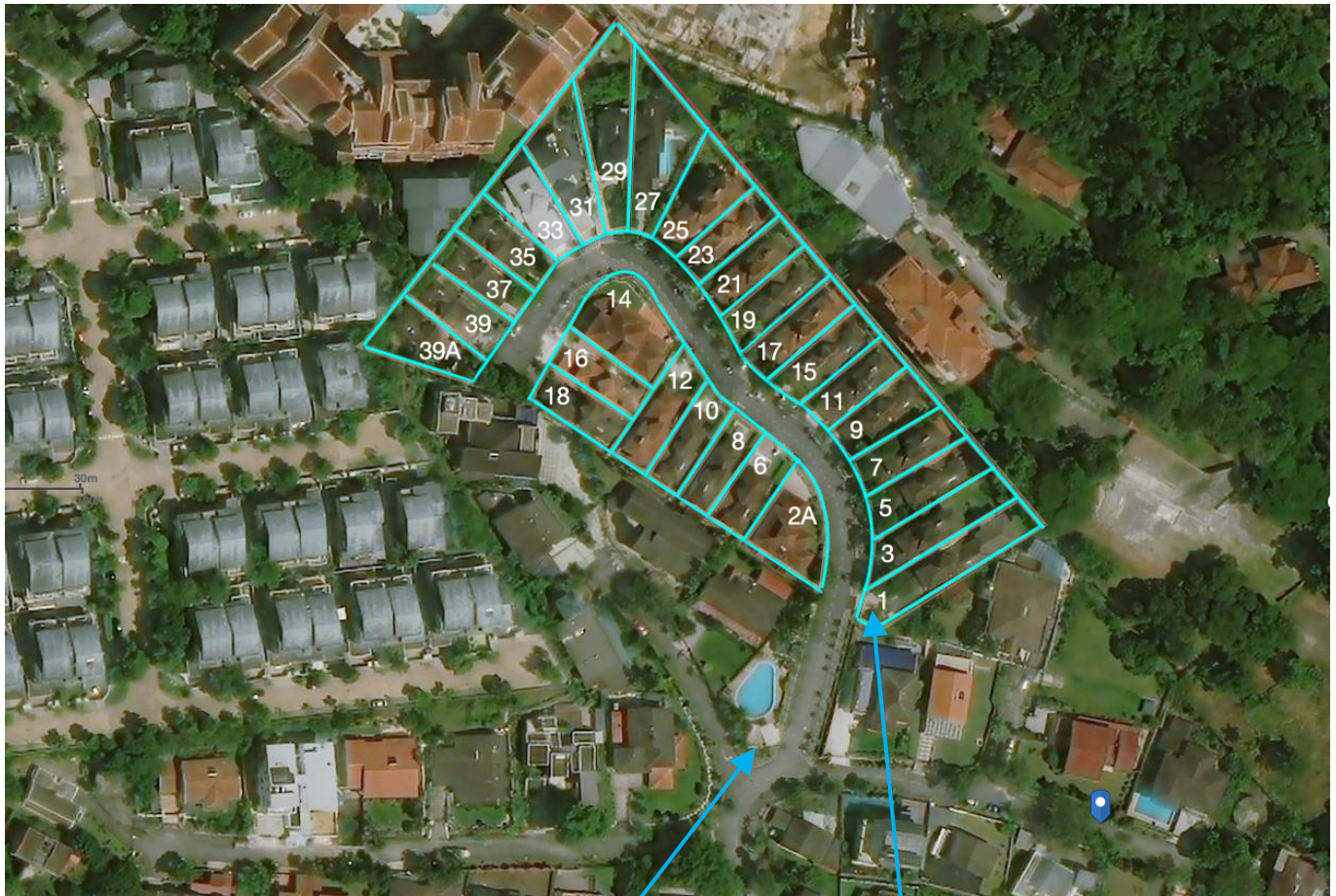
Bird's-Eye View of Jelutong Villa Gated & Guarded Development