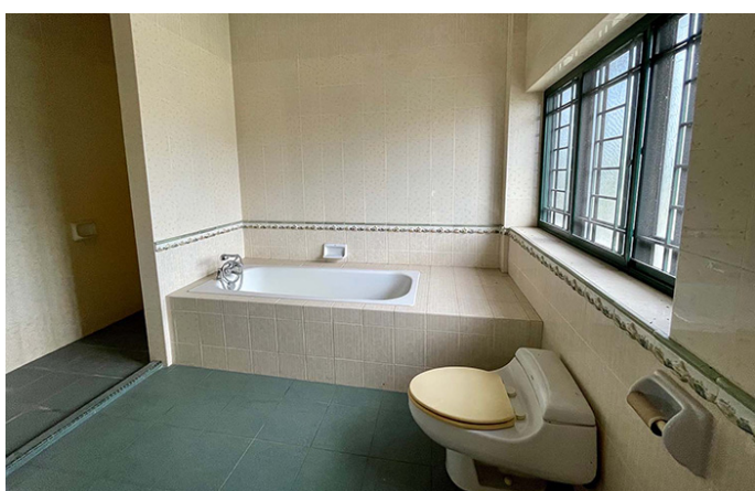
Master Bathroom View from Master Bedroom