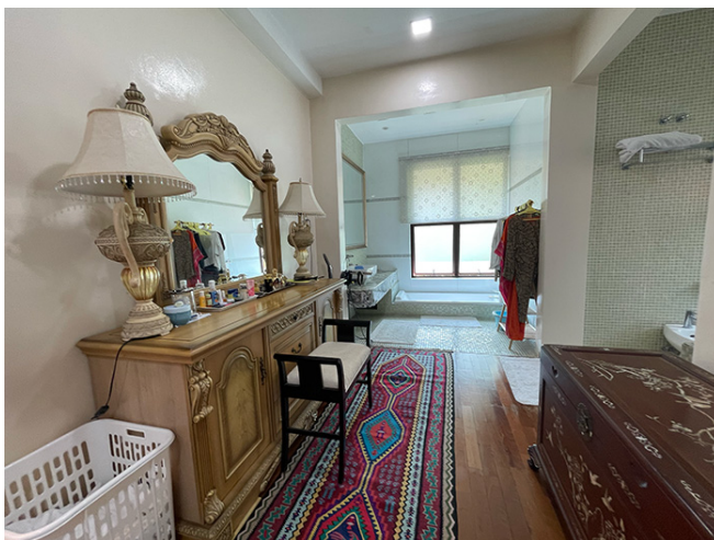
Second Bedroom (Converted into a Study)