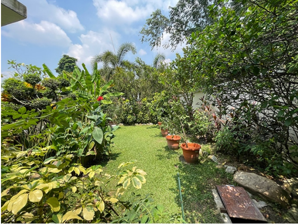
Side & Front Garden