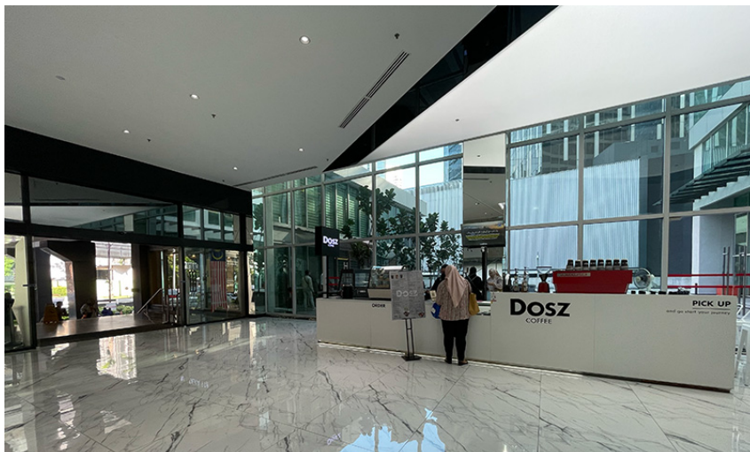
TAKE-AWAY COFFEE @ THE LOBBY