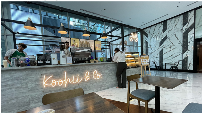
CAFÉ @ THE LOBBY