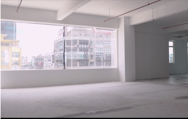
Typical Floor Space