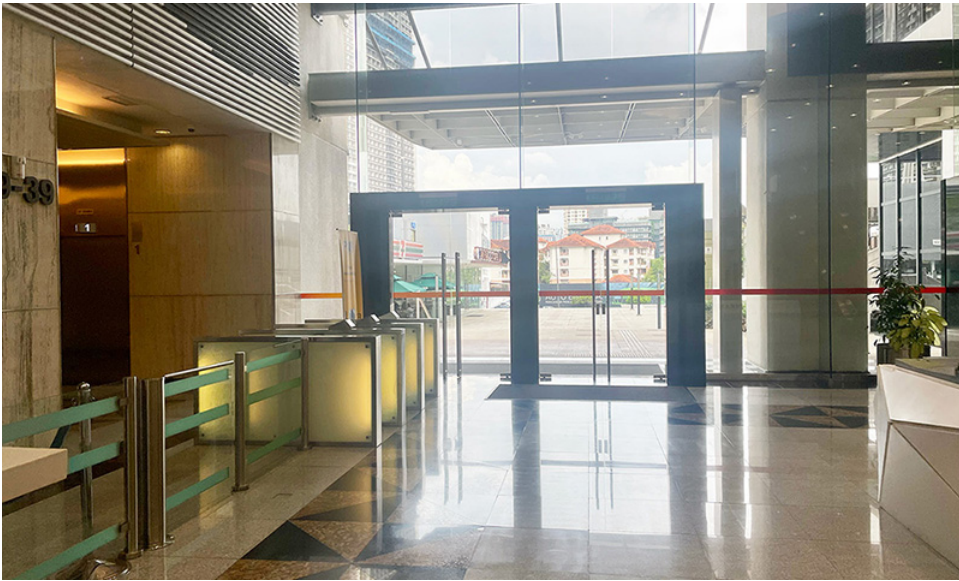
LIFT LOBBY ON UG FLOOR