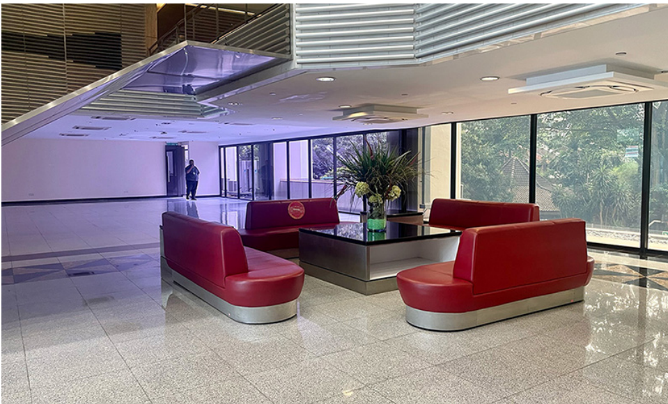
WAITING AREA ON UG FLOOR