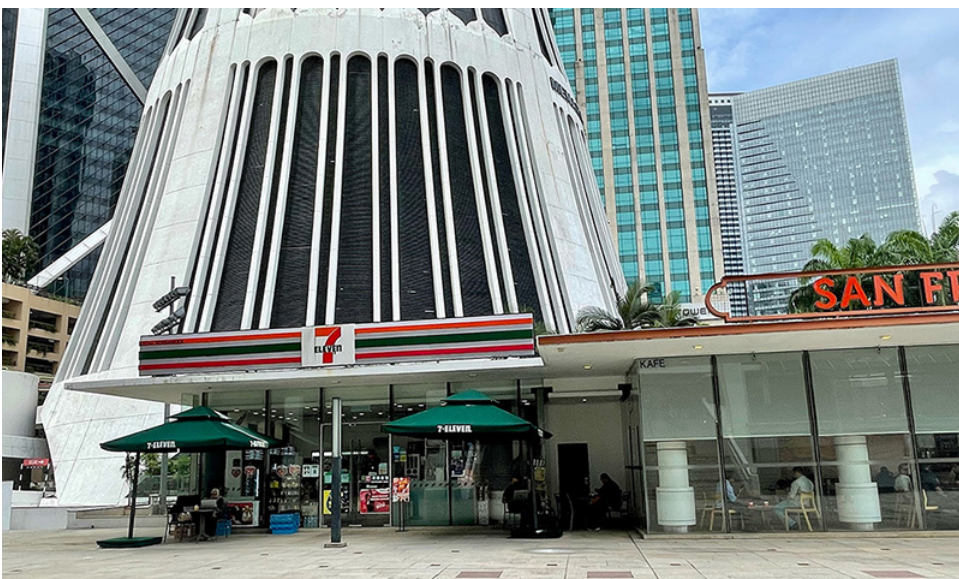
UG FLOOR F & B OUTLETS