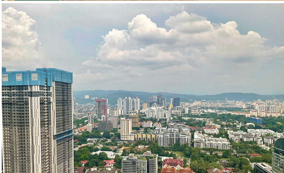
VIEW FROM 39 TH FLOOR OFFICE