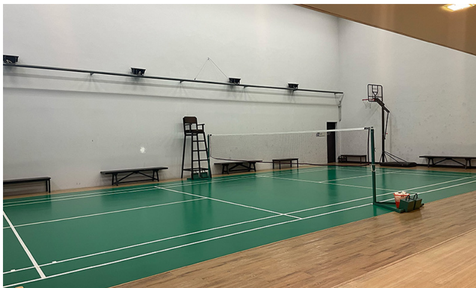
BADMINTON COURT @ LEVEL 40