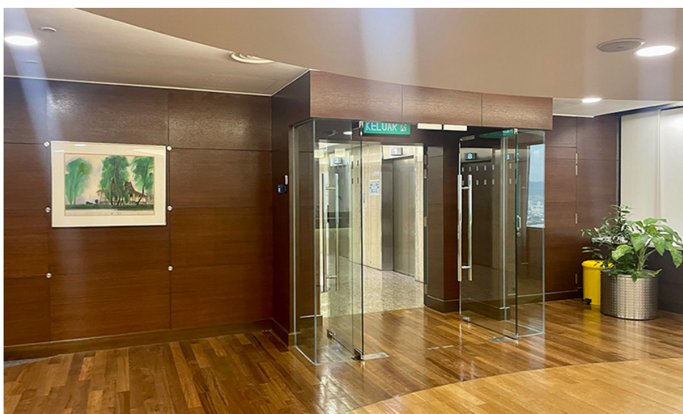
ENTRANCE TO CORPORATE OFFICE