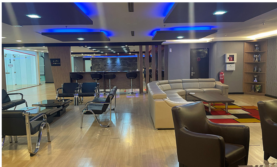
LOUNGE @ LEVEL 40