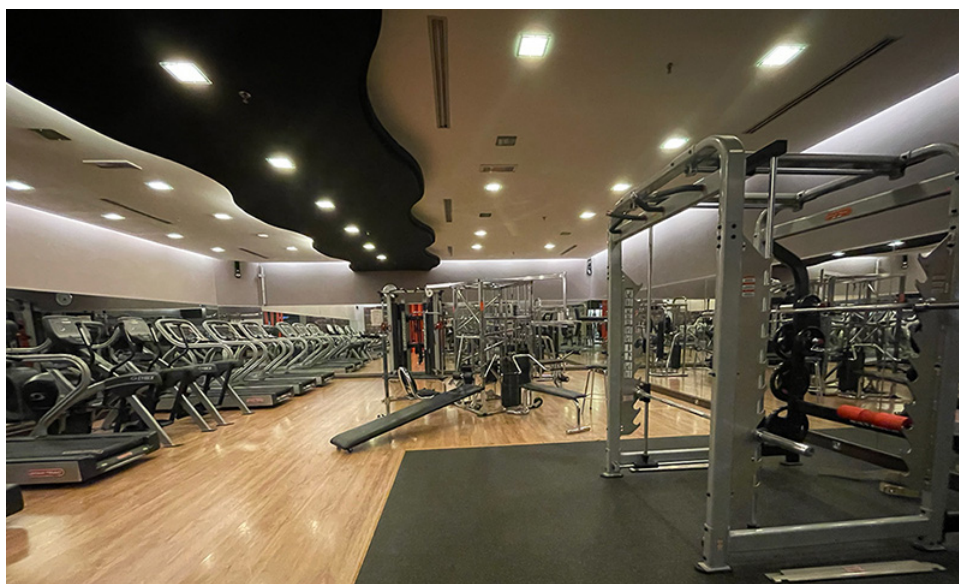
GYM @ LEVEL 41